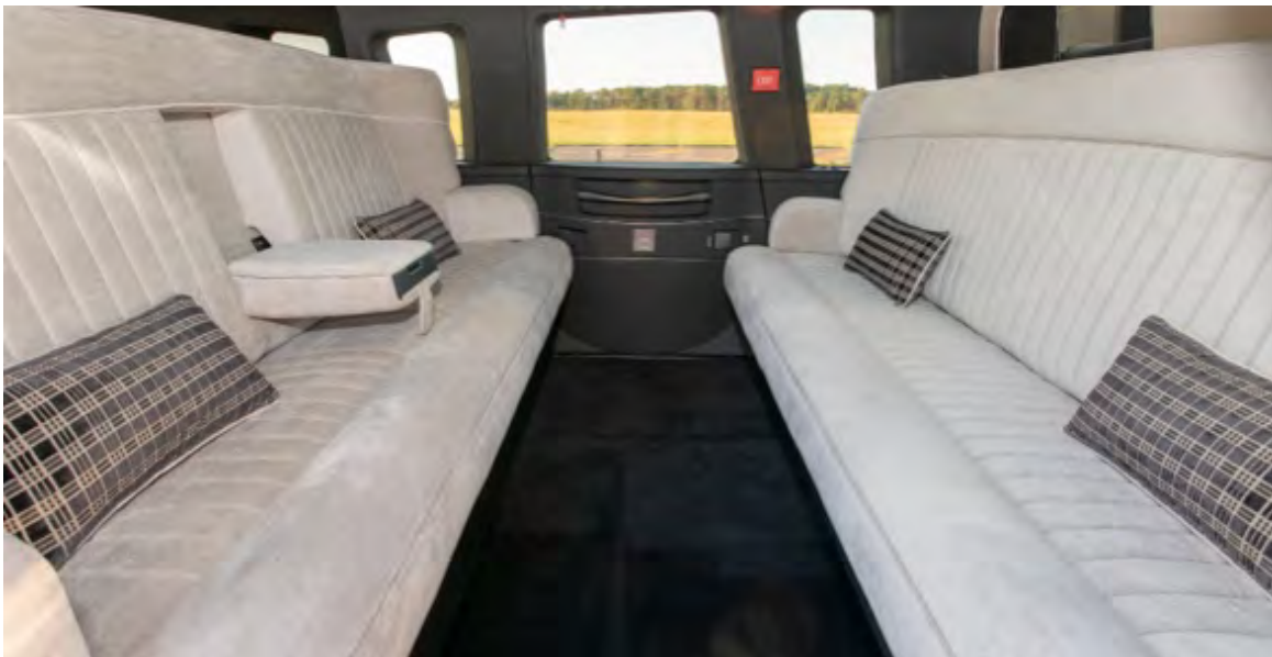
8 Seat Configuration

401 INDUSTRIAL AVE. TETERBORO, NJ 07608 - GEORGE@JETASG.COM - (201) 906-1411