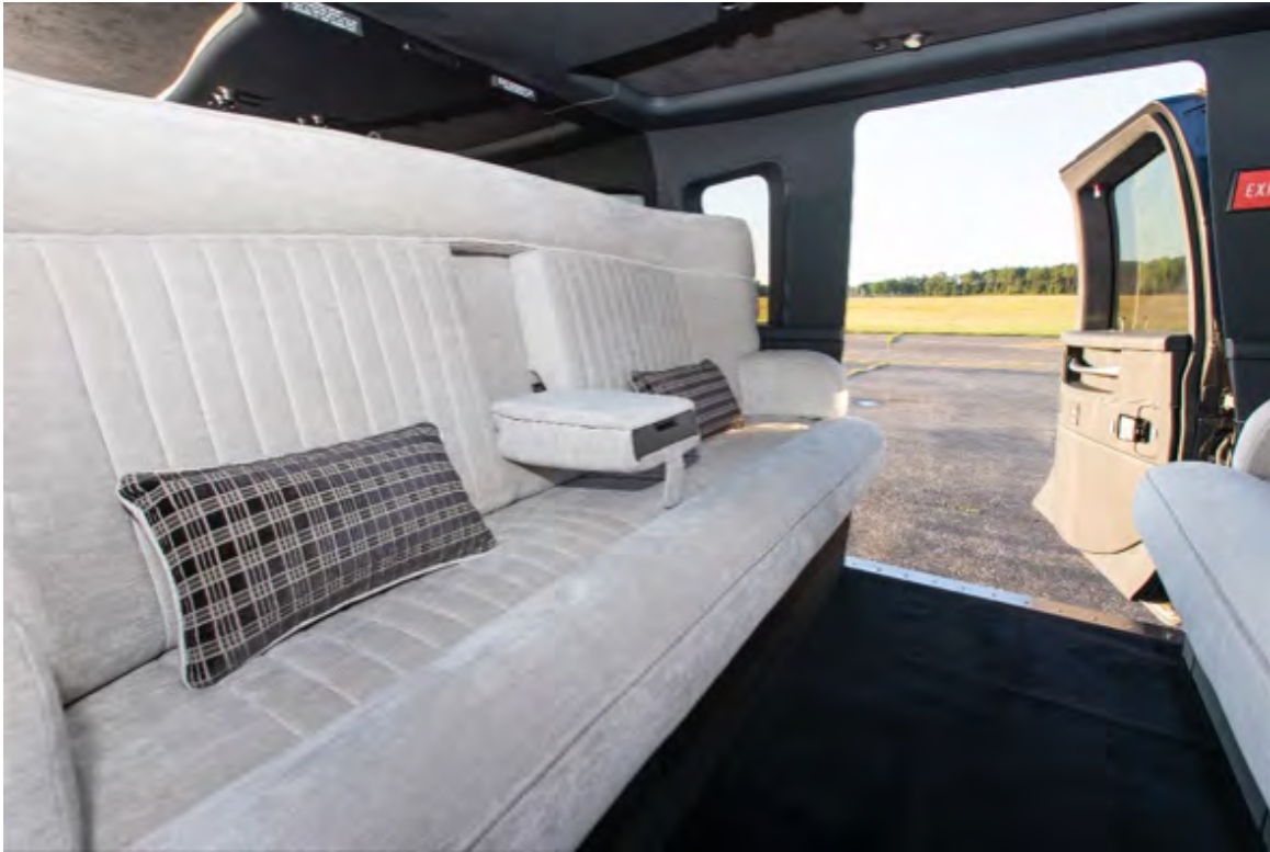
Seats Facing Forward